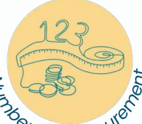
Numbers & Measurement

In our Early Storytelling program, we strive to nurture healthy reading habits by bringing stories to life! Reading aloud is a fun and effective opportunity to advance language skills in children. Our stories are not only loved by students but we share lessons important to parents. After each class, students receive stories and homework to review at home.