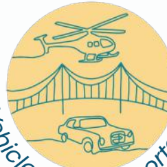
Vehicles & Transportation