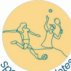
Sports & Athletes