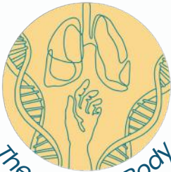
The Human Body